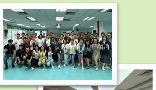
4 MFG bootcamps and celebrating the successful completion of training!