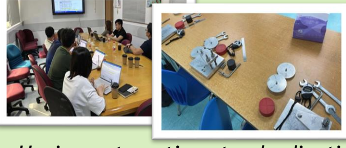
Having automation standardization workshops across multiple sites

Built foundational capabilities, upskilled 300+ practitioners