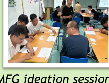
MFG ideation sessions (cameras not allowed on shopfloor!)