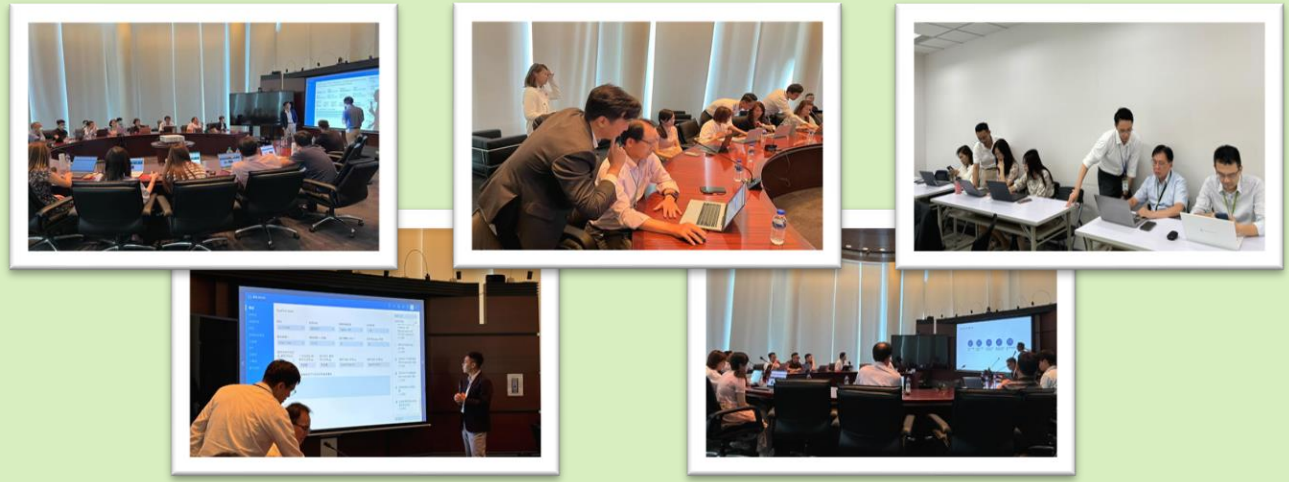
Having WAVE training sessions with Transformation Office, Topline(sales), and Procurement

Established various critical transformation infrastructure (e.g., Transformation Office, Wave Tool, Meeting Cadence, Financial baseline)