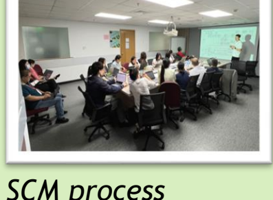
SCM process workshop to highlight pain points