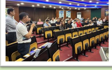
Organizing SCM kickoff with 100+ leaders

Currently there are 300+ of us in the transformation, and there will be more and more to join very soon!