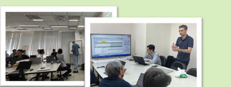
Conducting 9 sessions of R&D standard project expense model working sessions