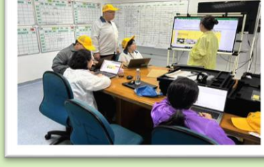
Working sessions on what change agents mean