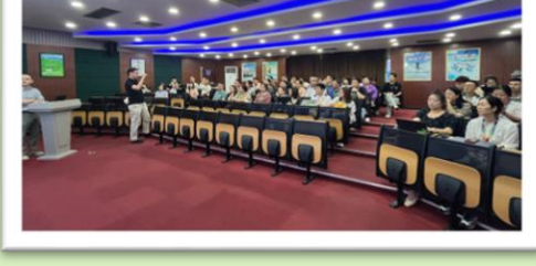
Mobilizing change agents in A31 Kunshan P3 site

Onboarded 40+ sponsors & leads, and 250+ initiative owners