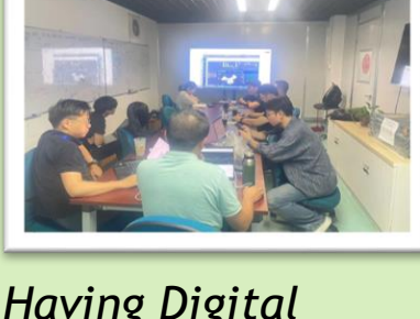
Having Digital vendor assessment working session

Started to generate initiatives through ideation workshops