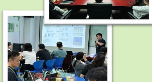
4 MFG bootcamps and celebrating the successful completion of training!